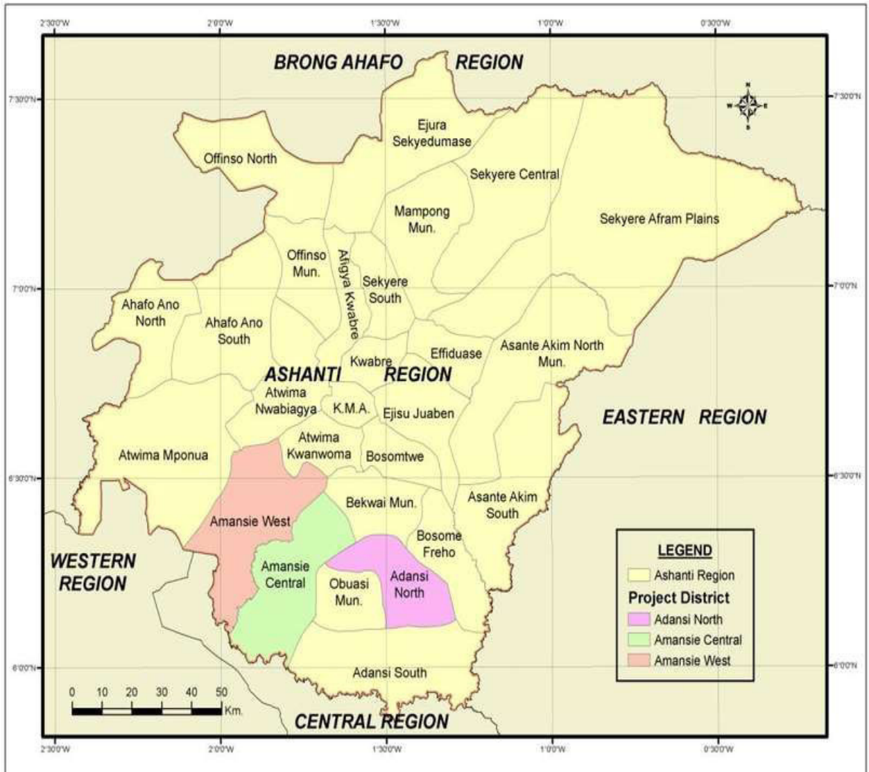
Figure 1.1: The District in Regional context