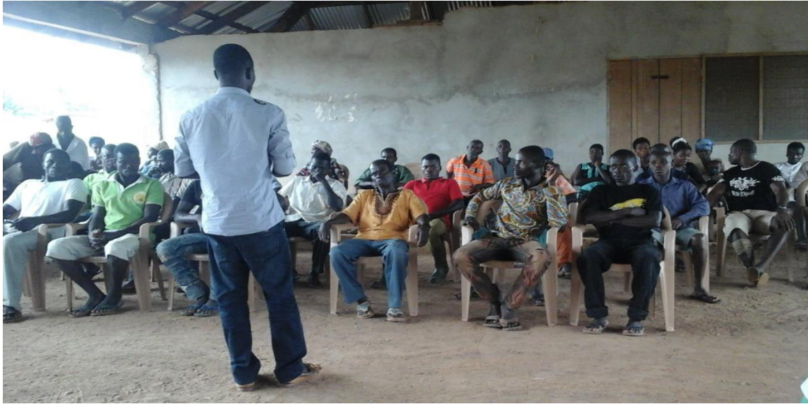
Community Engagement at Assuwuah