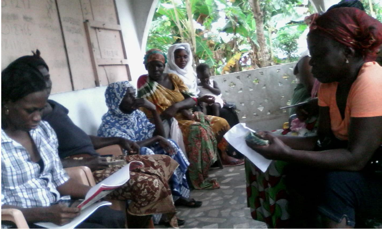
One of the Women Empowerment Group having Meeting