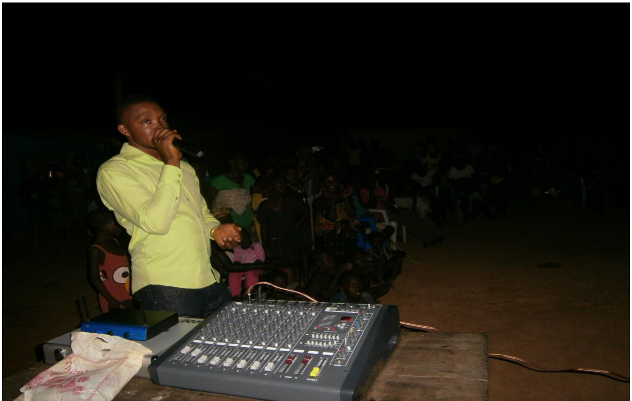
Community Engagement at Akonu/ Domunli