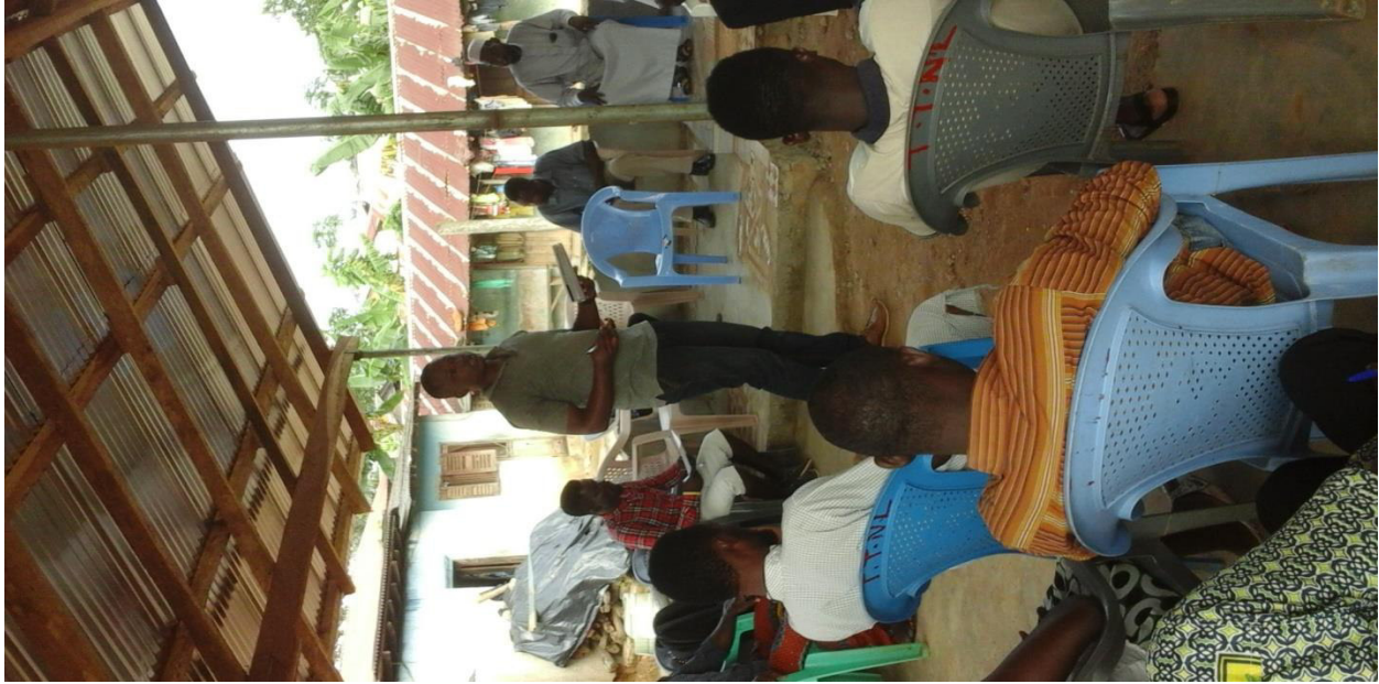
Community Engagement at Fantekrom